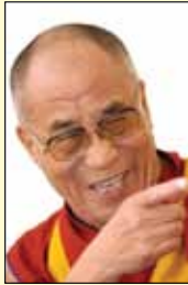
The Dalai Lama