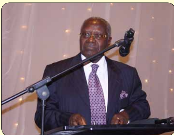
Hon. Iddi Simba - Guest Speaker, Entrepreneurs' Day, 2009