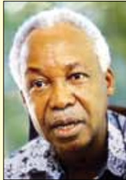
Julius K. Nyerere