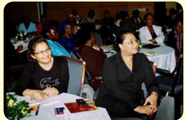
Delegates - Women Summit 2008