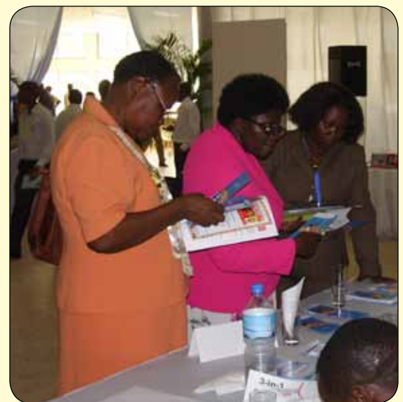
Exhibition during the Entrepreneurs' Day 2009

Concept development, Fundraising, securing event/exhibition sponsorships, event website development for updates and online registration, development and execution of the media strategy for awareness creation, designing and development of the branding materials ie) brochures and flyers, mass email marketing campaign, Contract negotiations with service providers; venue selection, exhibition stands/contractors, conference transport facilities, writing and editing materials including press releases, web copy, company/products brochures, speeches, biographies and fact sheets, corporate gifts developments, protocol arrangements, accommodation bookings, delegation confirmations, venue branding as well as professional speaking services.