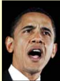
Barack H. Obama